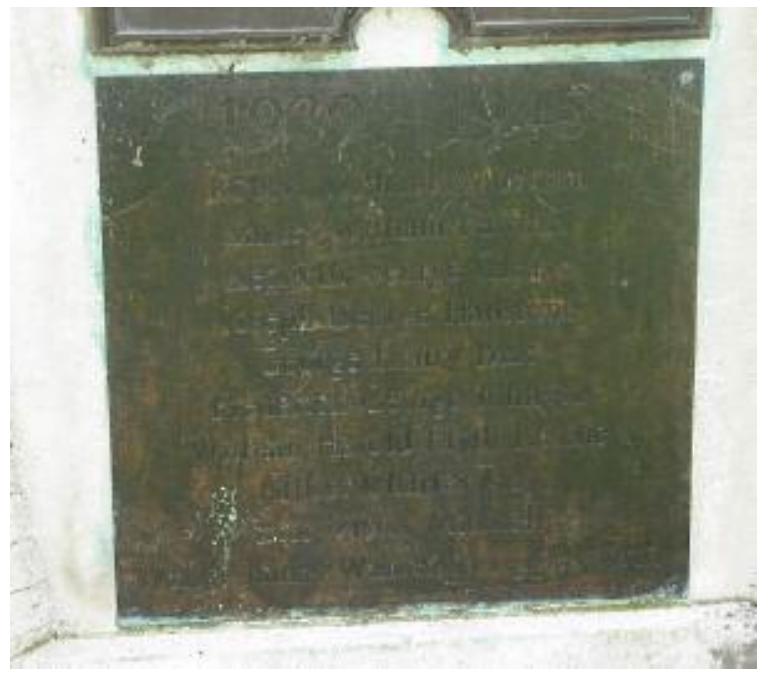
The 10 names from WW!